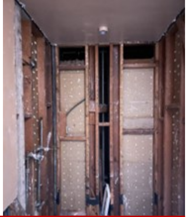
Inside one of the gutted spaces: corroded pipes, leaks, etc.

Let me say right off the bat: THERE WILL BE NO EVENING MASS THIS COMING TUESDAY OR WEDNESDAY EVENING, NOVEMBER 8 AND 9, due to our being in Redlands for Carmelite meetings all day, both days.