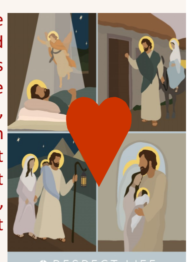
• RESPECT LIFE