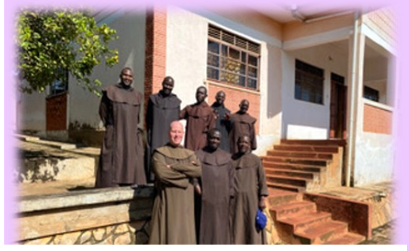
Some of the Carmelite Community in Uganda (in front of the St. Joseph House)

As I happily served the good people of St. Therese Parish as your pastor, now I serve the Carmelite Order as the Regional Superior of the Carmelite Mission in Uganda (as well as the Rector of the Ugandan seminarians). And as we worked so hard together to reform the School, now let's do it again to build up the Ugandan Mission! Whereas this mission of St. Therese is nearly 100 years old, our Mission in Uganda is only 20 years old. Whereas we have over 50 friars in our Mother Province here, we have only 15 in Africa. But we're growing! As the Churches here in the U.S. are managing the decline of Catholicism, in Africa we are experiencing an explosion of vocations! Five of our seven seminarians are studying Philosophy and Theology in Nairobi, Kenya. It costs about $700 a month for each man to go through that formation.