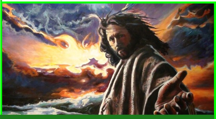
"Whoever wishes to come after Me must deny himself, take up his cross, and follow Me" (Matthew 16:24).

How do we experience this dying to sin? First, we identify the sinful areas of our life. Do I watch movies, video games, or TV shows that encourage promiscuity, lying, revenge, hatred, or selfishness? What sins do I confess repeatedly and what can I do to avoid them? Next, we