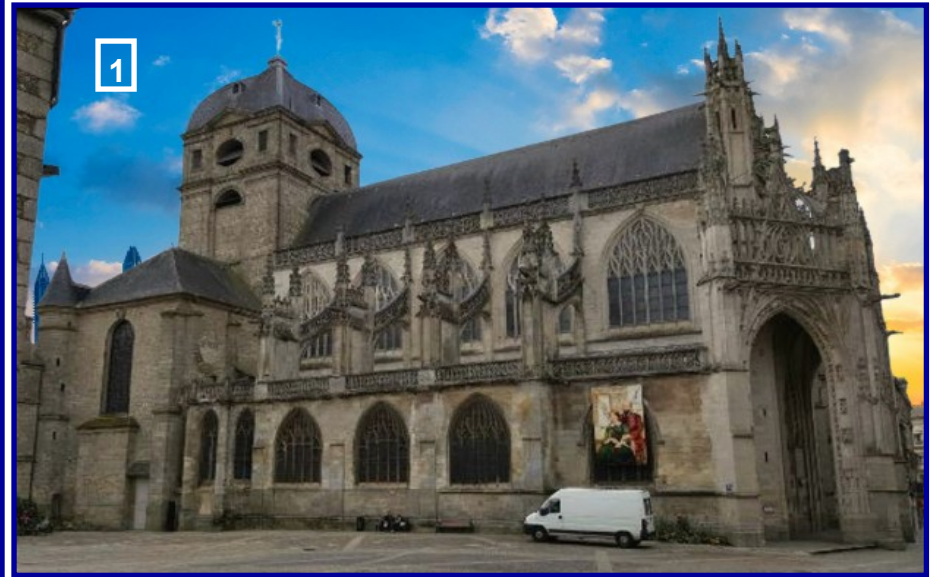
1 & 3: Exterior/Interior of Notre Dame Basilica in Alençon; 2: Stained glass window in NDB commemorating the baptism of St. Therese; 4-6: Insets of the baptism window; 7: A stained glass window in NDB honoring St. Thérèse